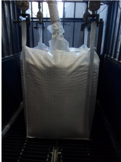
Sun-Stat FIBC on Properly Grounded Filling and Discharging Equipment